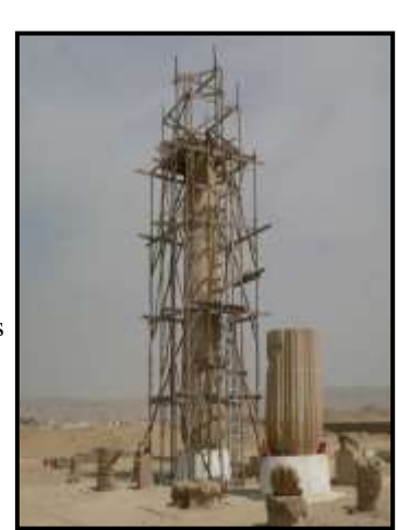
Column at Small Aten Temple Aten Temple Project

To date what is your most memorable moment at Amarna? Answer: I don't have a most memorable moment. I have a continuum of memories of satisfaction simply in working there, whether on the site or inside the expedition house. Amongst the most satisfying are the first day of every season, when the lengthy process of getting everyone and everything into place culminates in the starting of work on the site. What a relief! Continued on Page 3